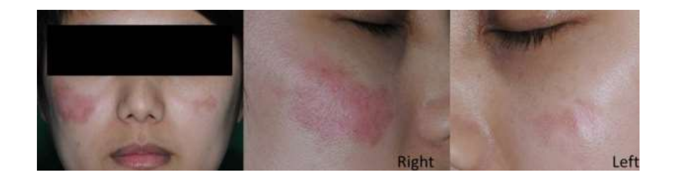
Figure 1: Tumid lupus erythematosus following hyaluronic acid filler injection. Bilateral erythematous, edematous nonscarring plaques with telangiectasias are located on both cheeks at exactly the previous injection points.

a 1:320 titer in a homogeneous pattern; however, anti-double stranded DNA was negative. Other blood tests were unremarkable. Based on the typical clinical manifestations and histopathology, the diagnosis of TLE was established.